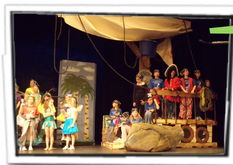
• Peter Pan