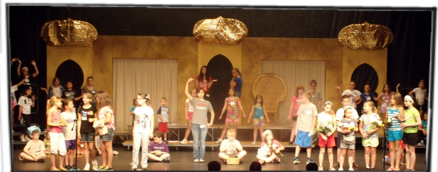
• Disney's Aladdin, Kids

Join us at Jackson High School for a week of musical theatre: dancing, singing and acting. Students will experience stage makeup and help create elements of their own costumes. The week will culminate with a performance of Disney's Alice in Wonderland, JR. on the final day of camp.