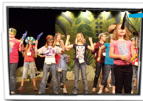
• Disney's Jungle Book, Kids