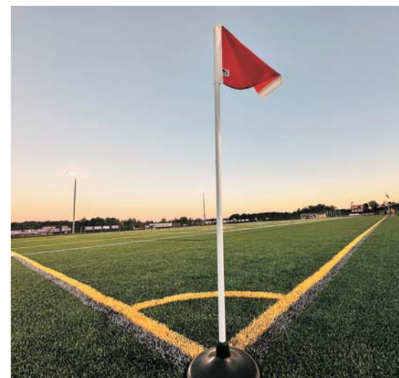
The new turf on the soccer fields, which can now double as youth football and lacrosse fields when needed.