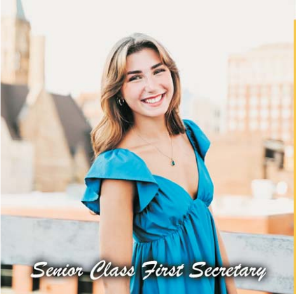
Senior Class First Secretary