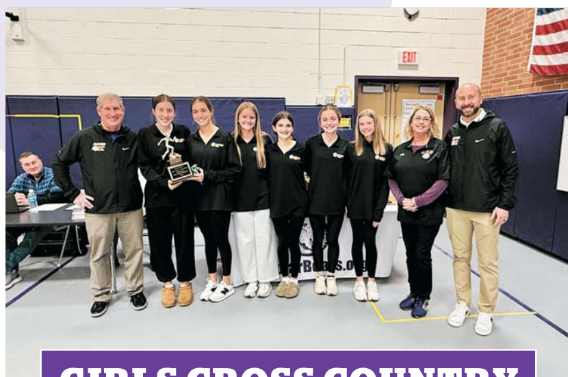
GIRLS CROSS COUNTRY