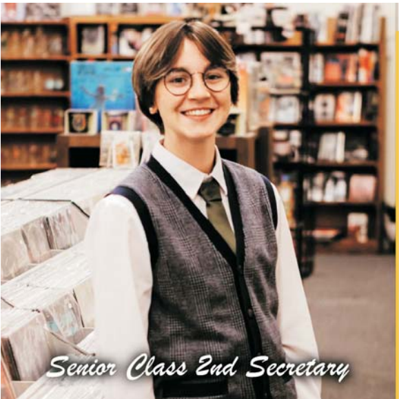
Senior Class 2nd Secretary