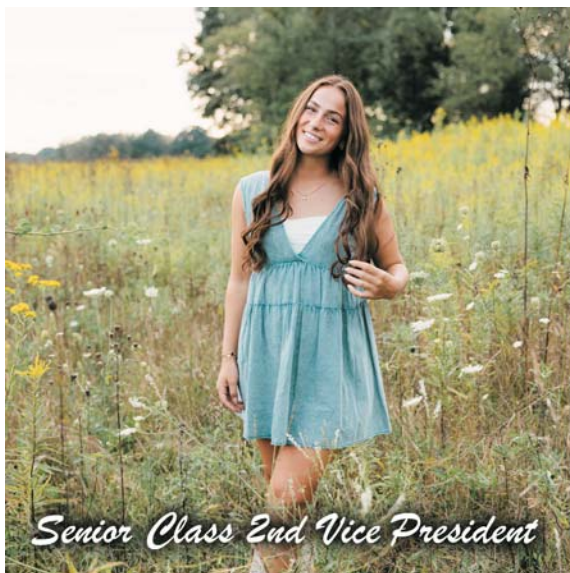
Senior Class 2nd Vice President