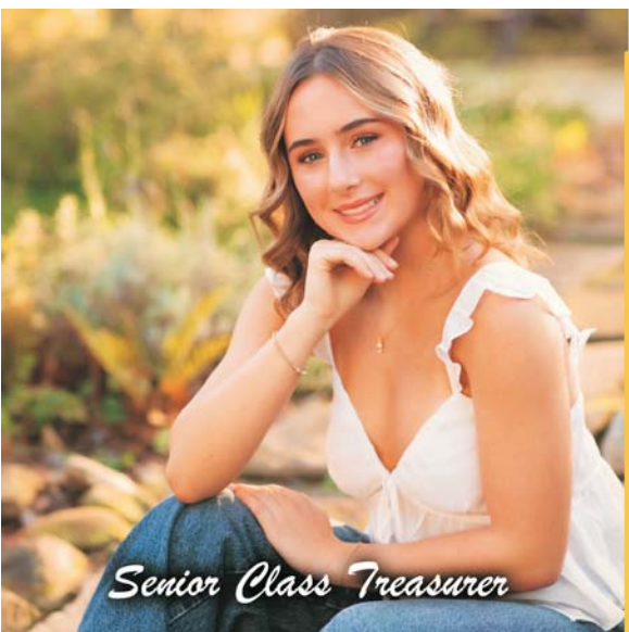
Senior Class Treasurer