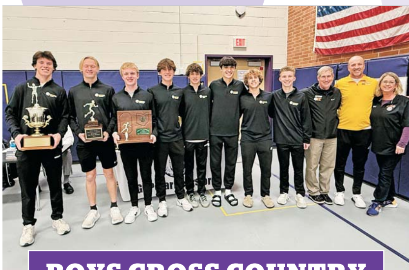
BOYS CROSS COUNTRY