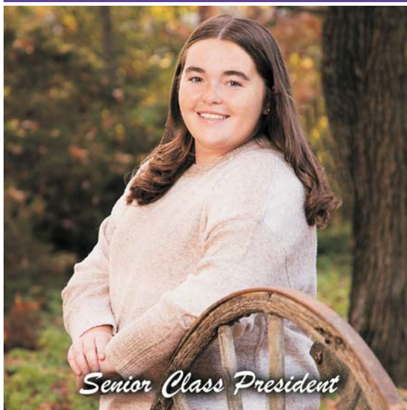
Senior Class President