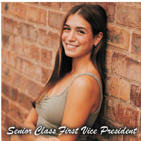
Senior Class First Vice President