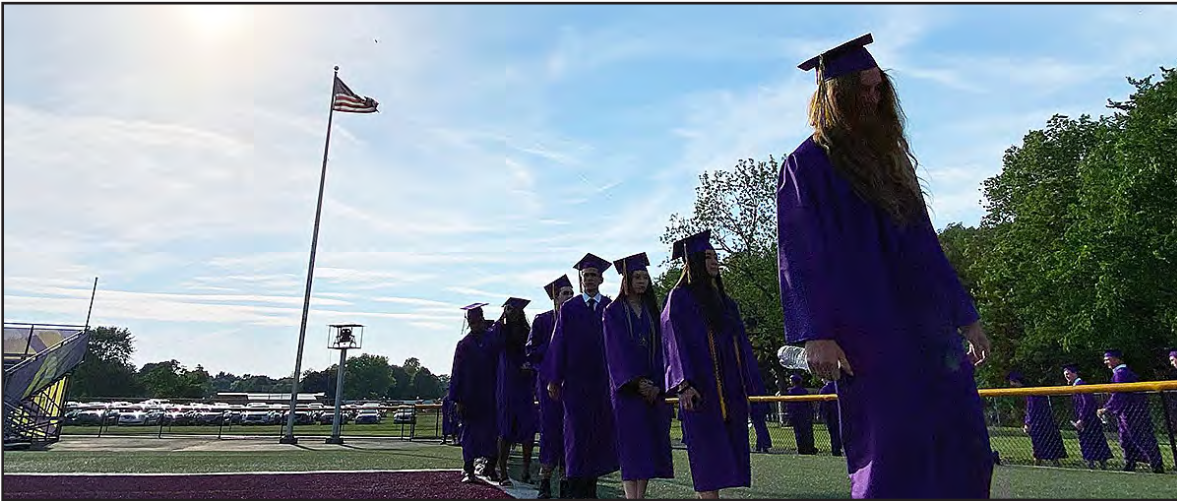
More than 430 members of the Class of 2021 march into Robert Fife Stadium for the processional during the May 25 commencement.